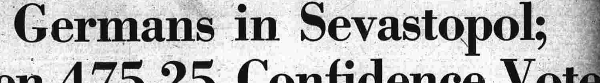
Strategic Suez in Danger. The Red Army reports that fighting was continuing in the Sevastopol direction but dispatches telegraphed yesterday by the Army newspaper Red Star said German assault troops had carried the battle into the city itself. Red Star's account pictures heavily superior numbers of Nazi forces willing slowly forward against staunch defenders of the Crimean base.

While fighting was carried into the Crimean base, the British believed still to hold strong positions on rocky Cape Suez, from the straits between Sevastopol and Balaklava.